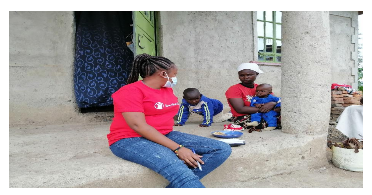
Case story documentation in Kochogo North Sub location, Nyando sub county.