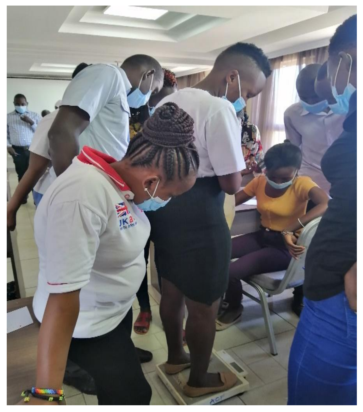
Training of RAs on anthropometrics in Nyando Subcounty