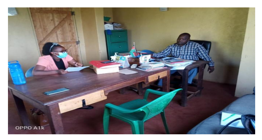
Interview with Chief, Nthawa Location