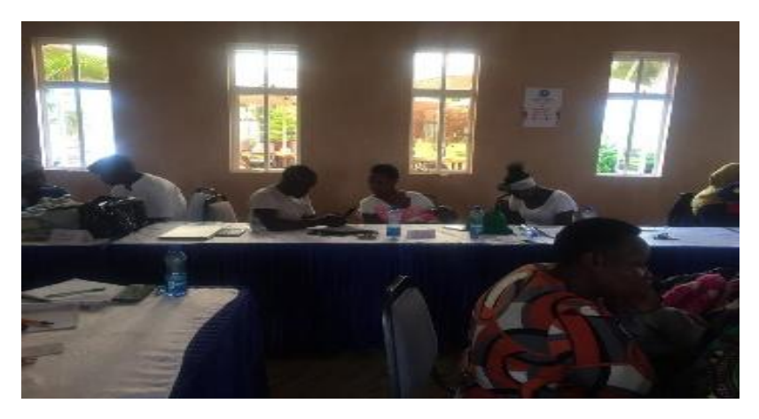
Research Assistants taking anthropometric measurements on respondents